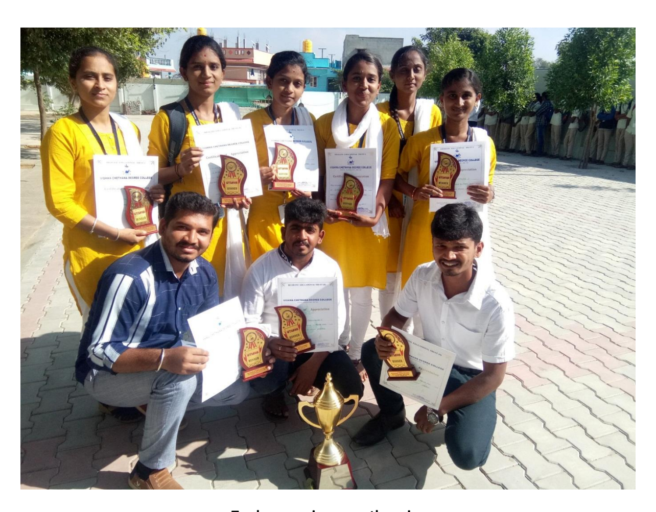
Trade emporium won the prize