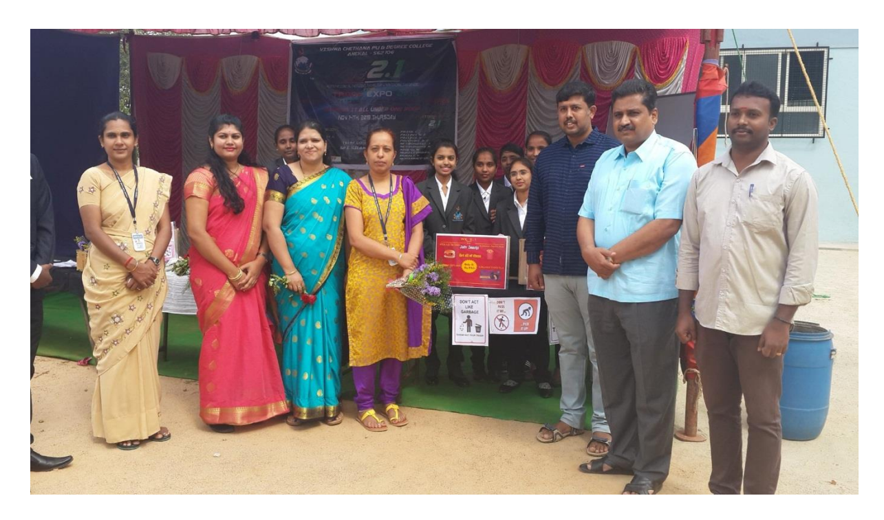
Business time team members with the chief guest, co-ordinator & faculty members