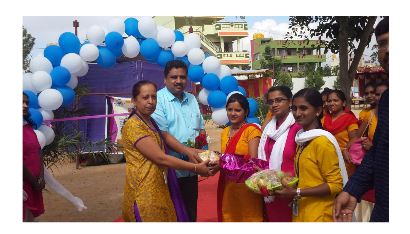
Chief guest visiting 'TRADE EXPORIUM' team