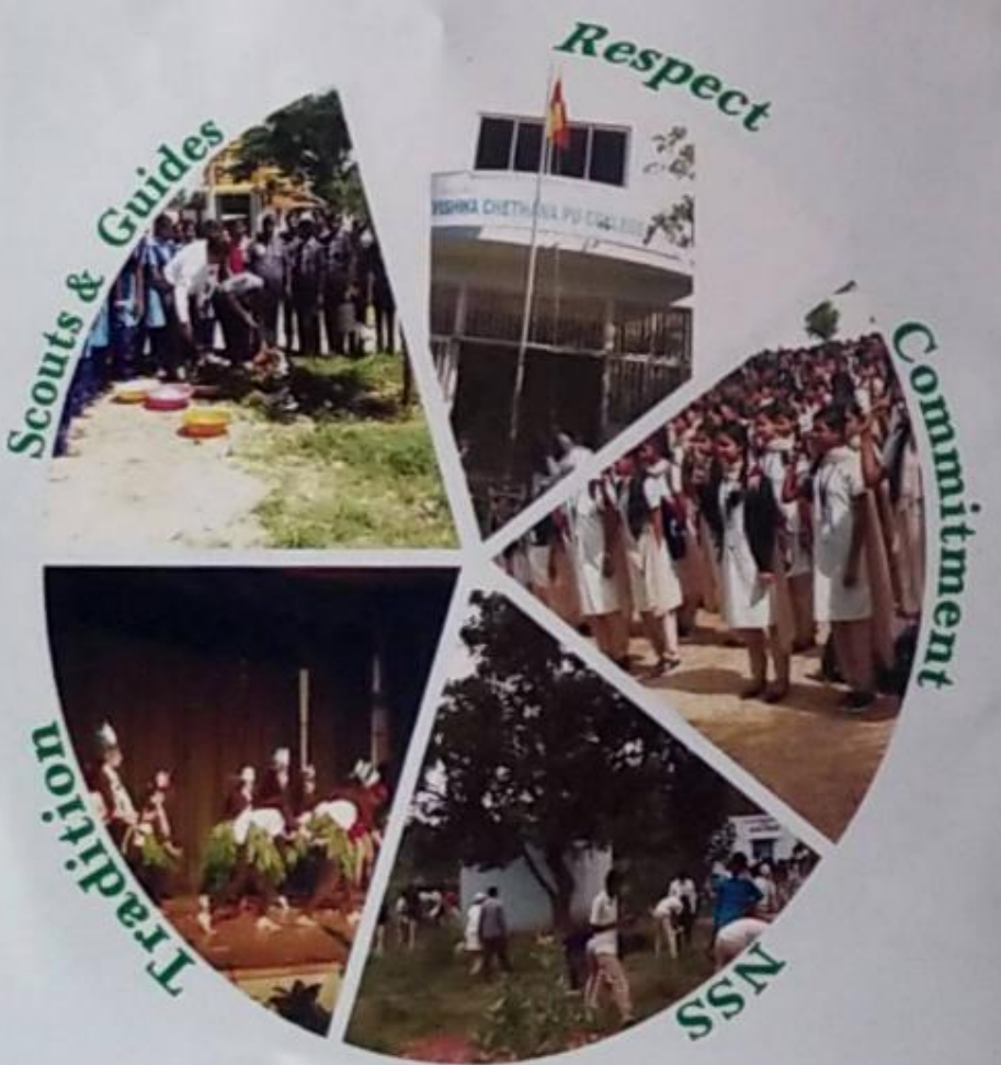
Vishwa Chethana College is designed to cater all of the above